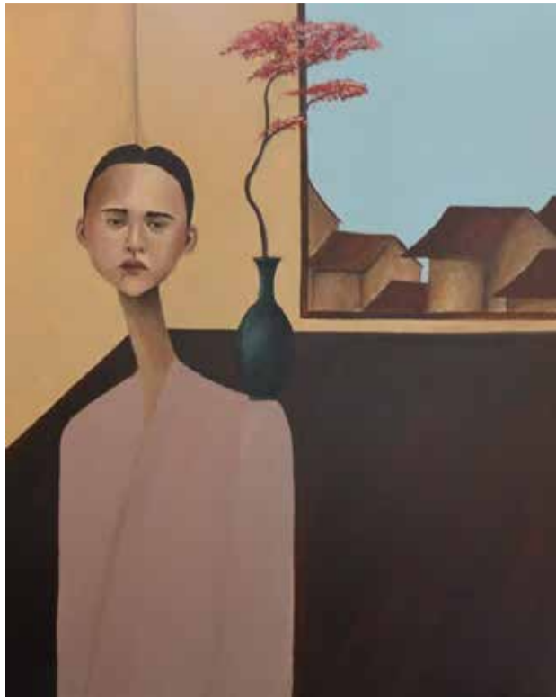
Golden Village 70 x 60 cm Acrylic on Canvas