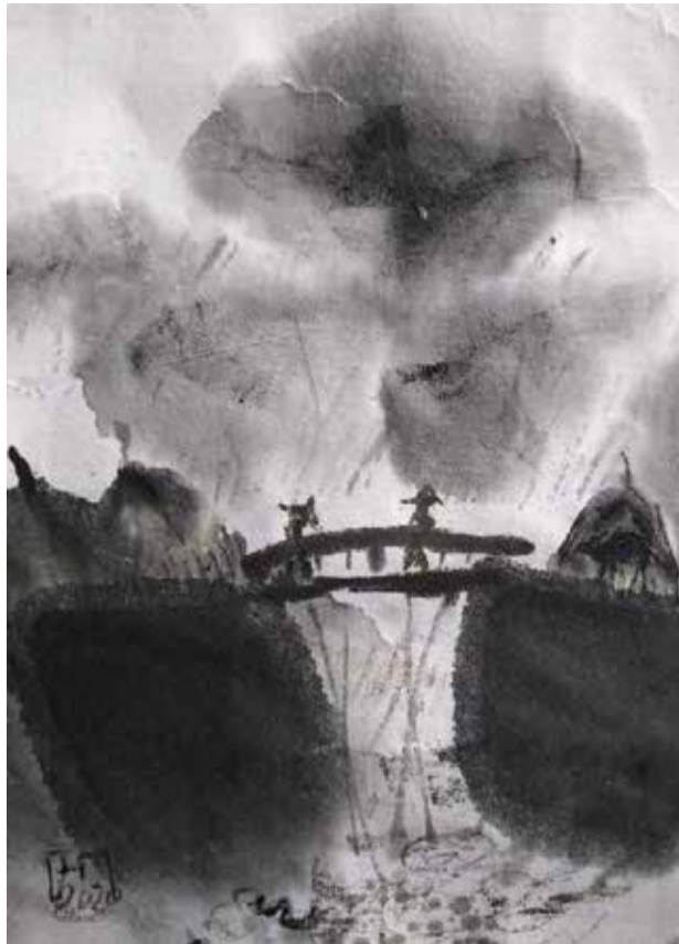
Rainy Meeting on an Unreliable Bridge, 2020 20 x 15 in Mascara on Chinese Paper