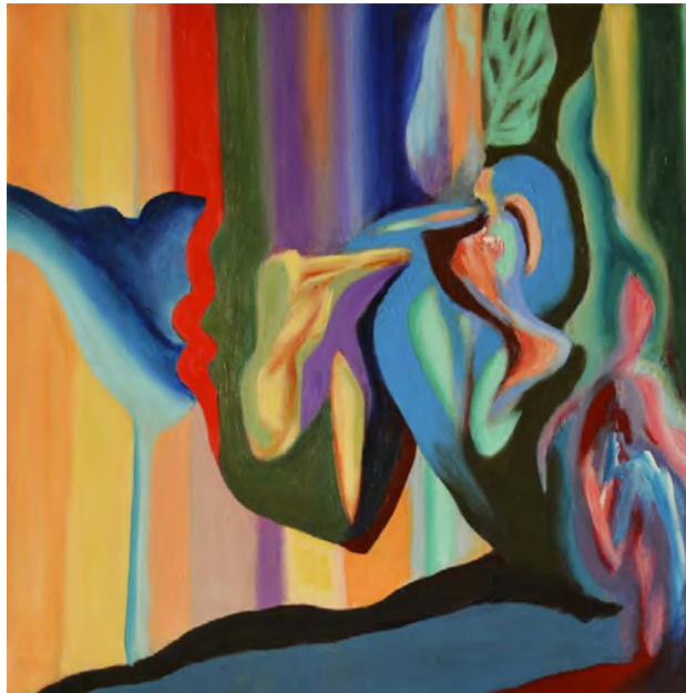
Dancing with Forest, 2021 50 x 50 cm Acrylic Paint