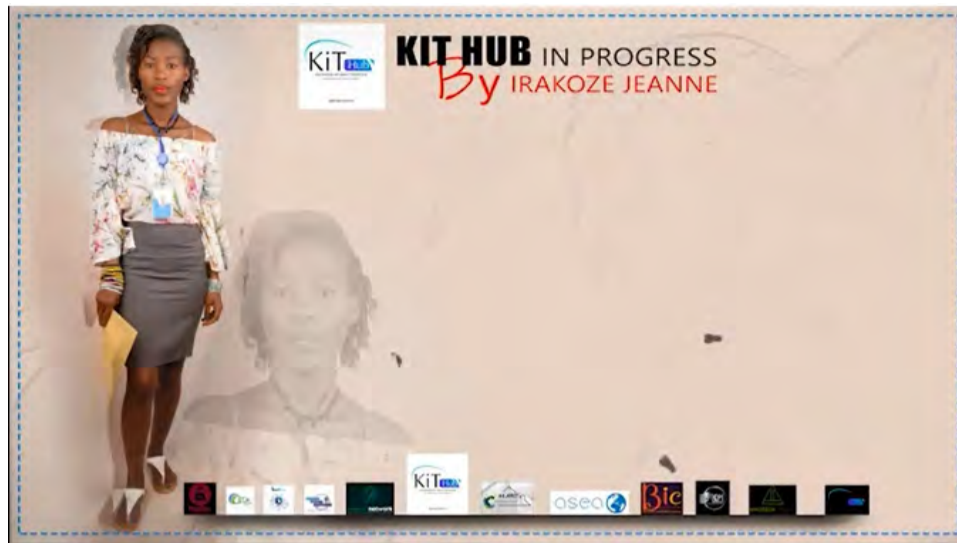
KIT Hub In Progress, 2021 16 x 32 cm Slam Poetry