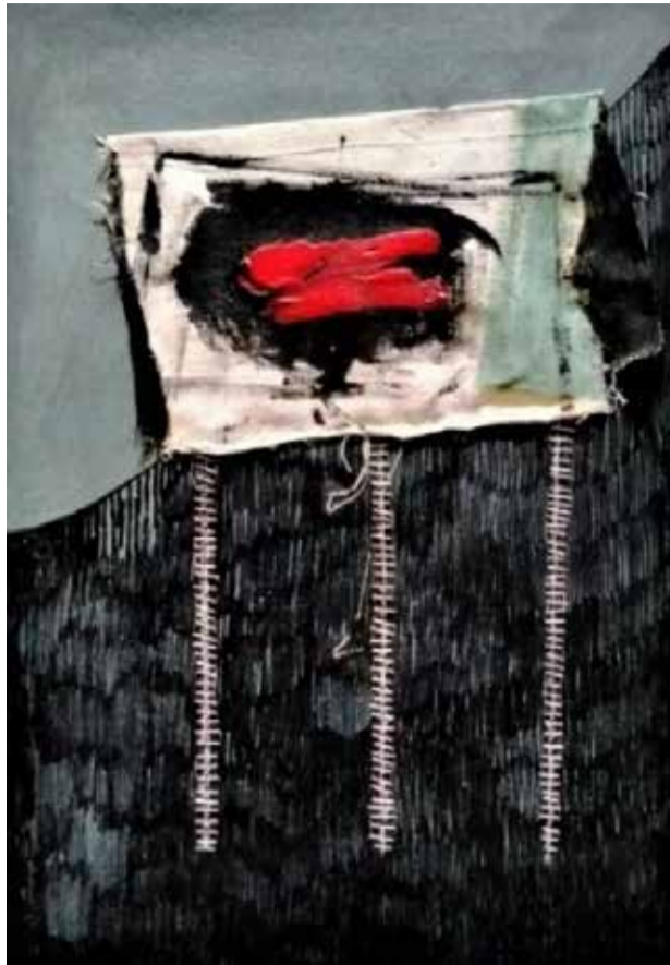
After the Chaos, 1, 2021 60 x 35 cm Oil Paint on Canvas