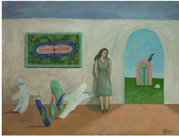
Waiting, 2020 From the series "Blown Reality" 60 x 80 cm Oil on Canvas