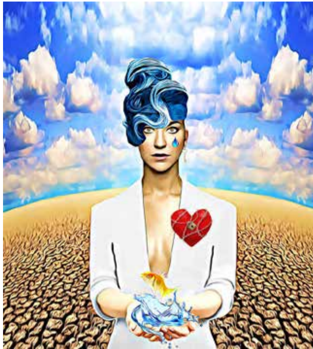
Chained Heart, 2021 24 x 18 in Digital Art