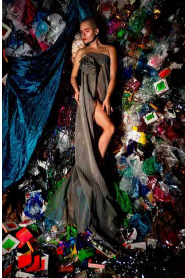
Evening Gown, 2021 From Plastic Doll Series, Doll House Collection 12 x 8 in Digital Photography