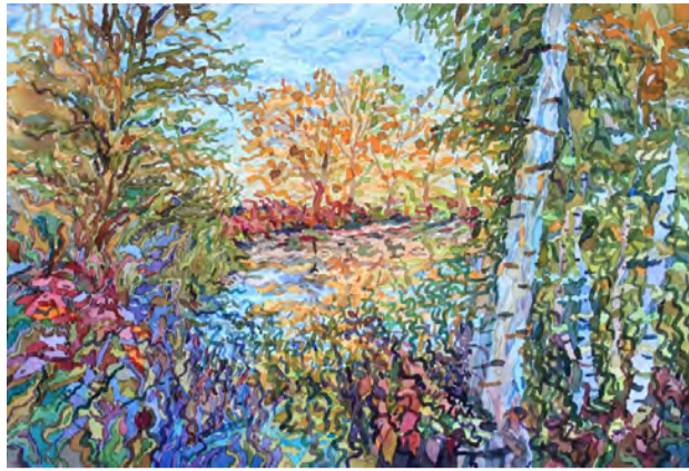
Forest Around the Pond, 2021