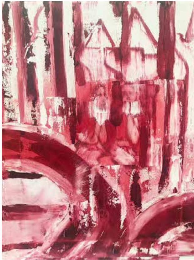
Journey II, 2021 14 x 11 in Oil on Canvas