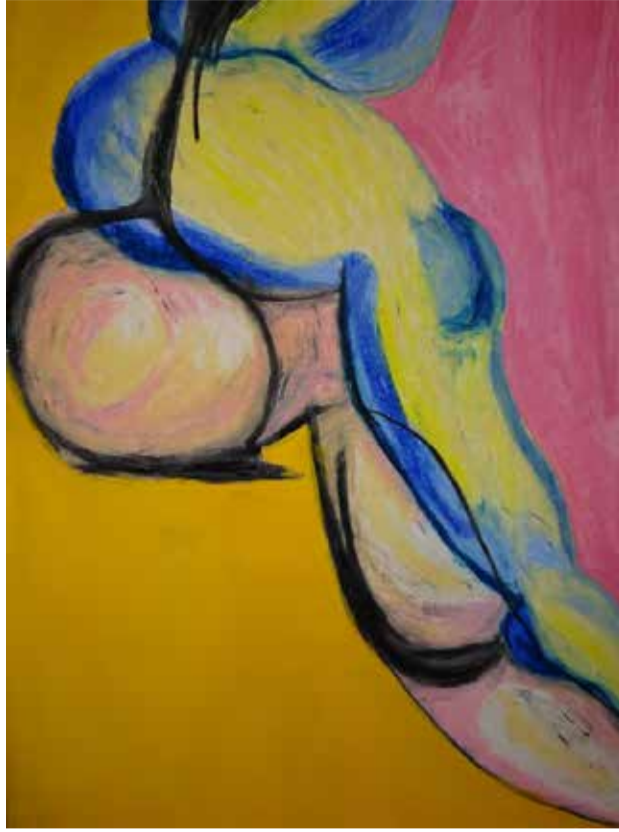
Abundance 13, 2021 100 x 70 cm Acrylic on Paper