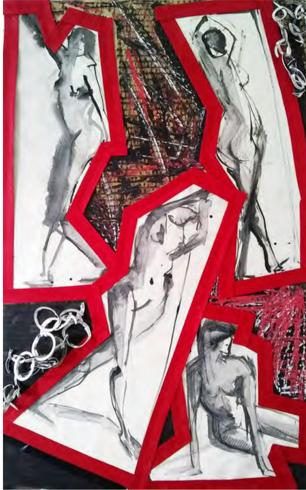
Inside/Outside, 2021 60 x 35 cm Mixed Technique