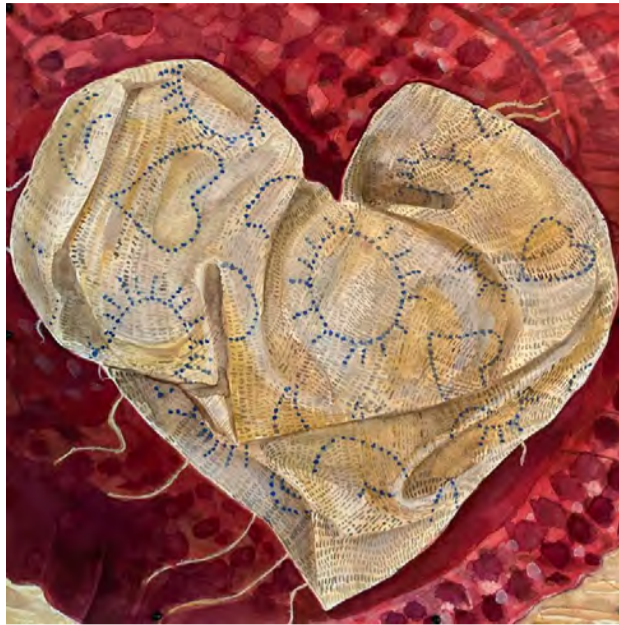
Magical Things from Quarantine Democracy Pattern, 2021 12 x 12 in Watercolor on Paper