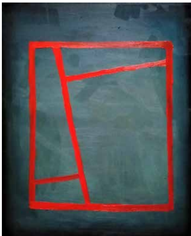
After the Chaos, 2, 2021 70 x 50 cm Oil Paint on Canvas