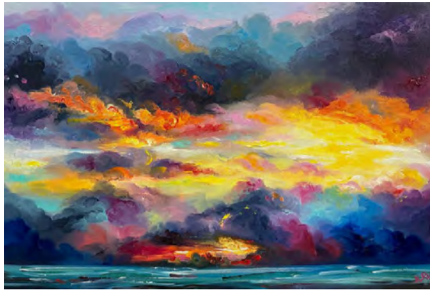
Prophecies, 2021 40 x 60 cm Oil on Canvas