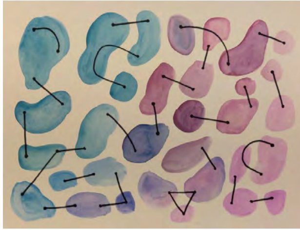
untitled connections, 2021 9 x 12 in Watercolor and Ink on Paper