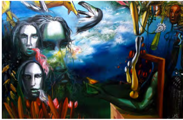
Tale of a Kingdom, 2016 54 x 72 in Acrylic on Canvas