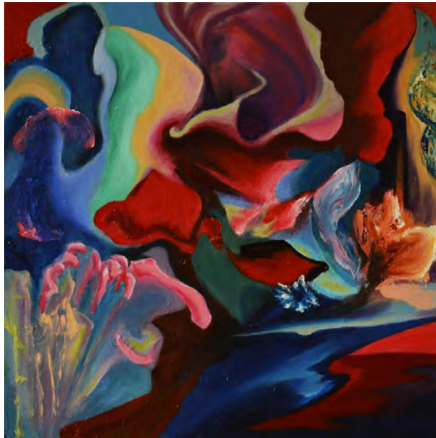
Intruding Into Flowers Among Lots Of Birds, 2021