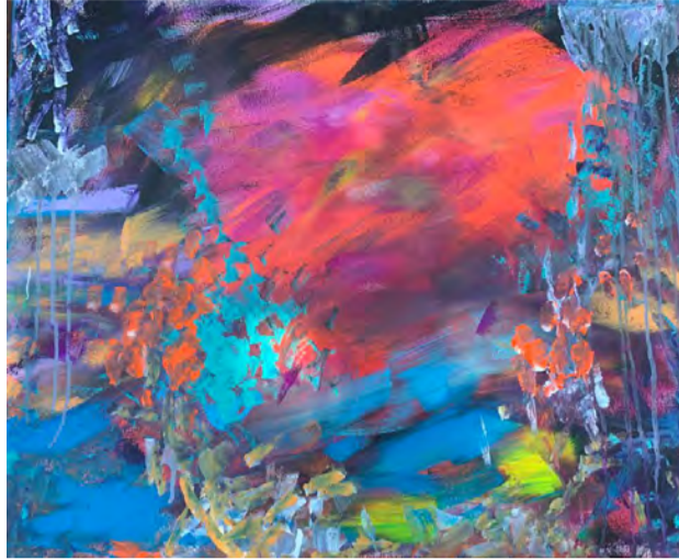
Wild Heart, 2021 24 x 30 in Acrylic on Canvas