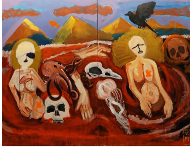
La Mer Rouge, 2020 115 x 140 cm Acrylic on Canvas