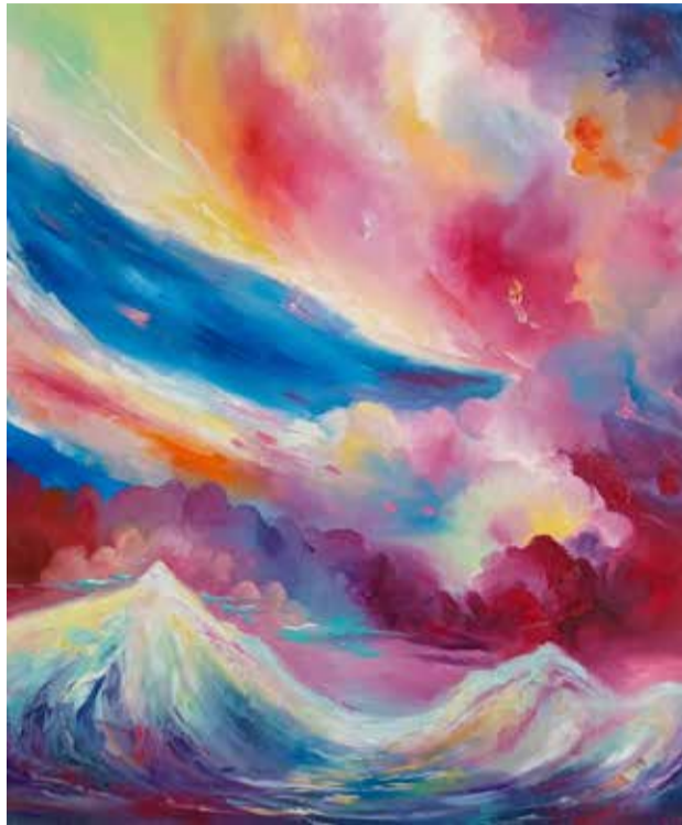
Alone with Life, 2021 60 x 50 cm Oil on Canvas