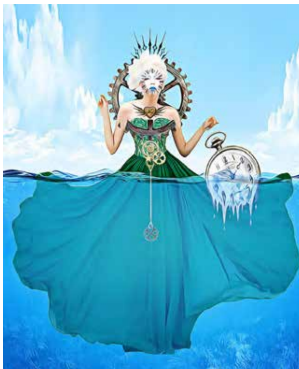
Timekeeper, 2021 24 x 18 in Digital Art