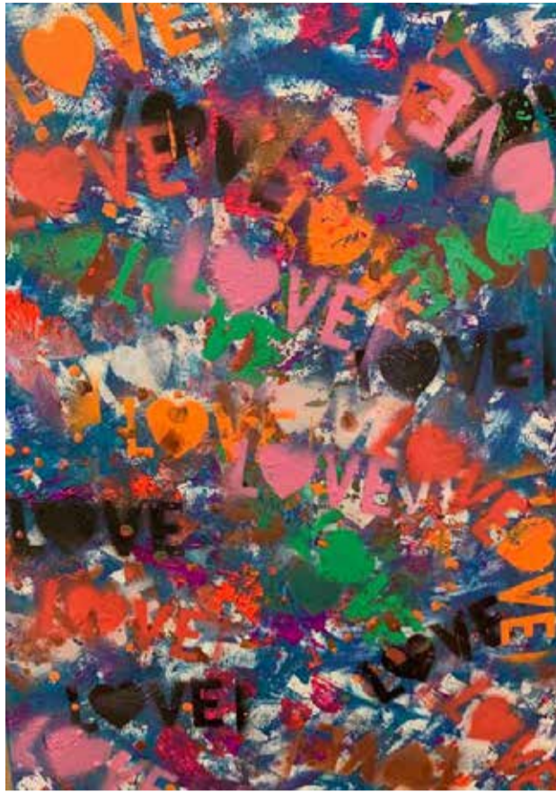
Wild Heart, 2021 12 x 12 in Acrylic on Canvas