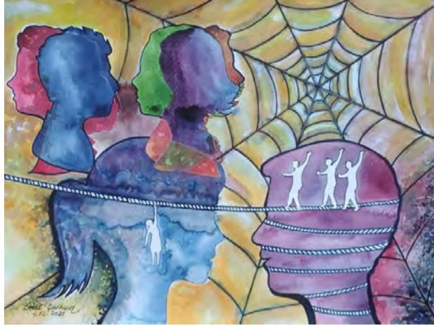
Women and Man, 2021 35 x 50 cm Watercolor