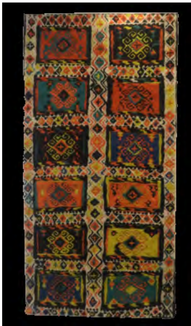
Georgian National Carpet, 2014