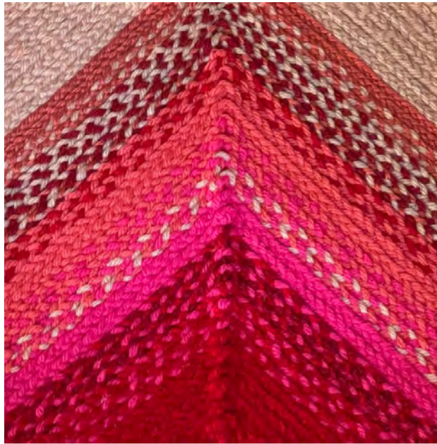
Limitless, 2021 8 x 8 in Yarn on Canvas