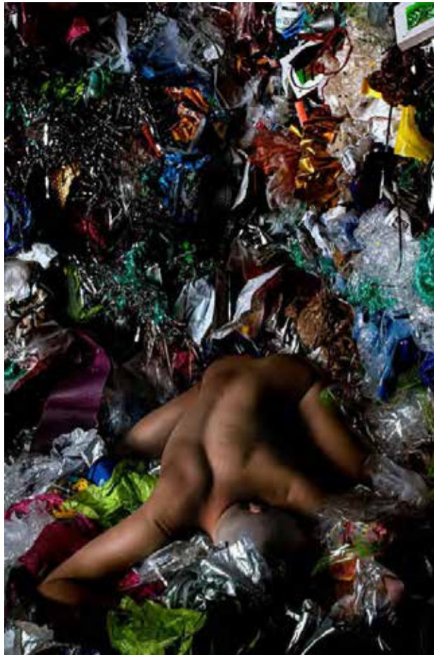
Sprawled, 2021 From Plastic Doll Series, Doll House Collection 12 x 8 in Digital Photography