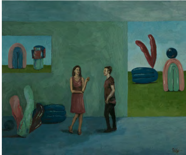
Inflated Fantasy, 2020 From the series "Blown Reality" 60 x 73 cm Oil on Canvas