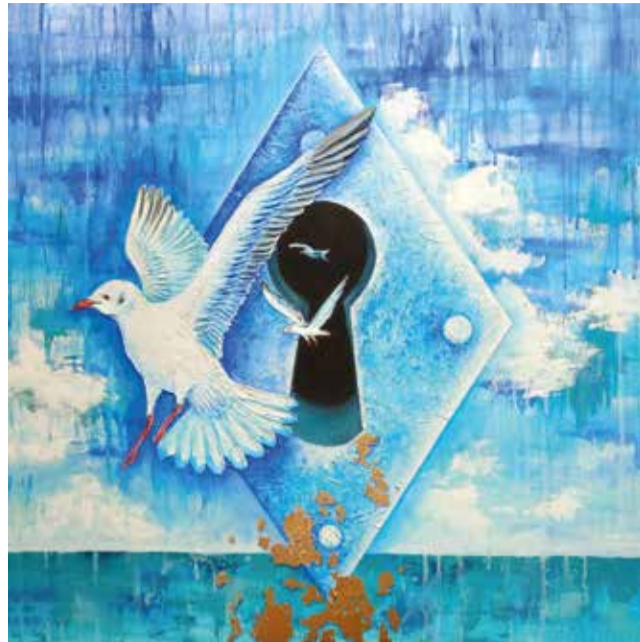
Beyond the Borders, 2021 28 x 28 in Mixed Media on Canvas