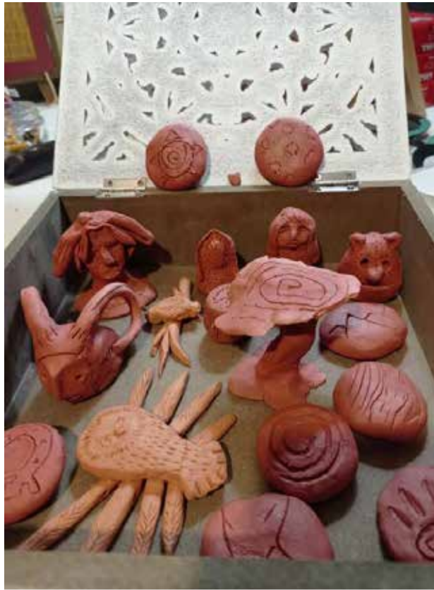
Ubuntu, 2021 10 x 8 in Ceramic