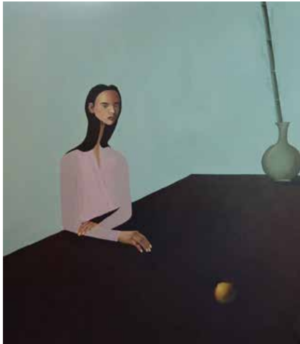
Hunger 100 x 90 cm Acrylic on Canvas