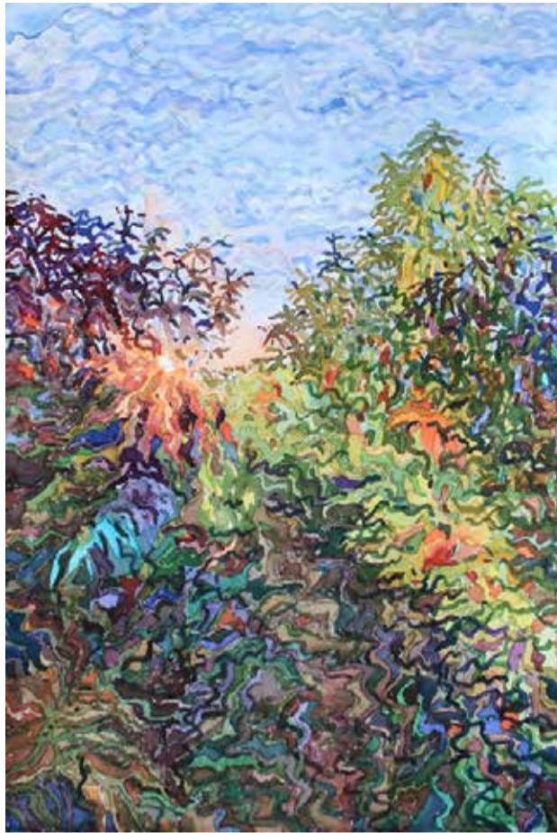
Secret Path in the Garden, 2021