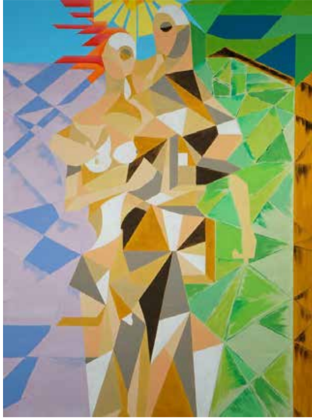
The Creation Of Adam and Eve, 2014 48 x 25 in Oil on Canvas