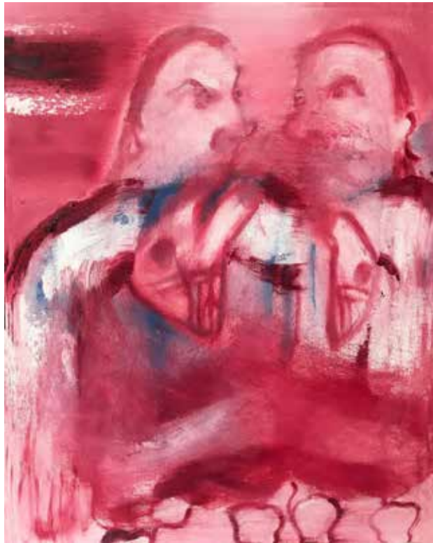
Half-Heart, 2021 14 x 11 in Oil on Canvas