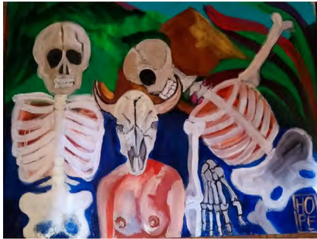
La Dans Macabre, 2020 70 x 115 cm Acrylic on Canvas