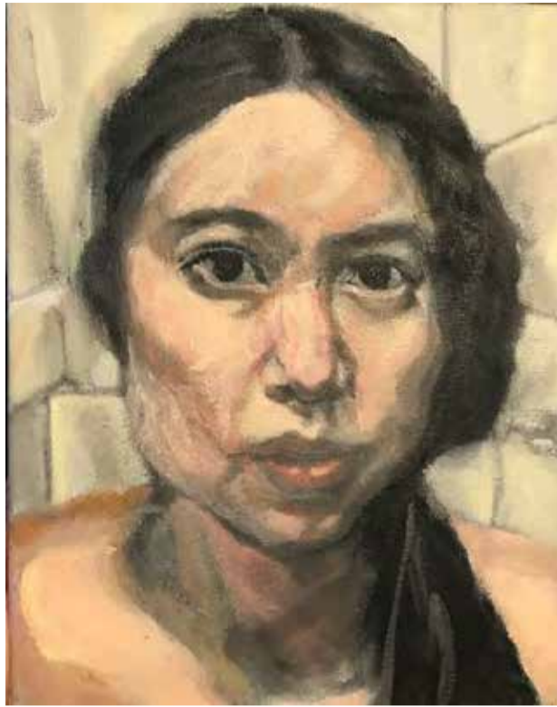
Yellow Portrait, 2021 12 x 10 in Oil on Canvas