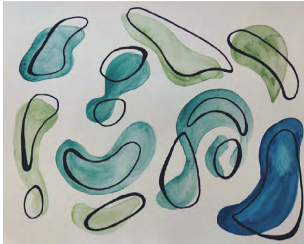
blood cell reception, 2021 9 x 12 in Watercolor and Ink on Paper