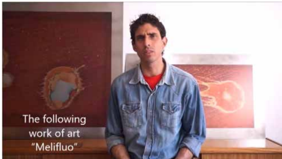
Melifluo , 2015 16 x 32 cm Cymatics and corrosion of copper