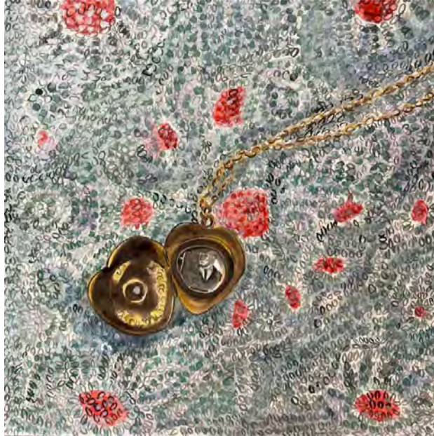
Magical Things from Recovery Locket, 2021