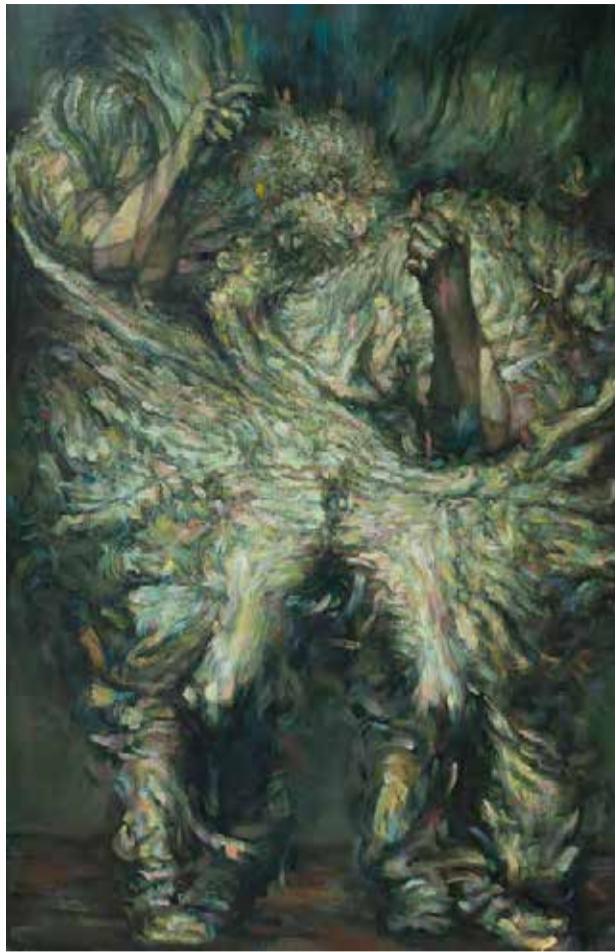
Yahoo, 2021 70 x 50 cm Oil Painting