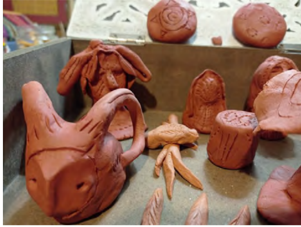
We Are Together, 2021 8 x 10 in Ceramic