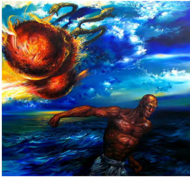
A Sunrise, 2021 60 x 54 in Acrylic on Canvas