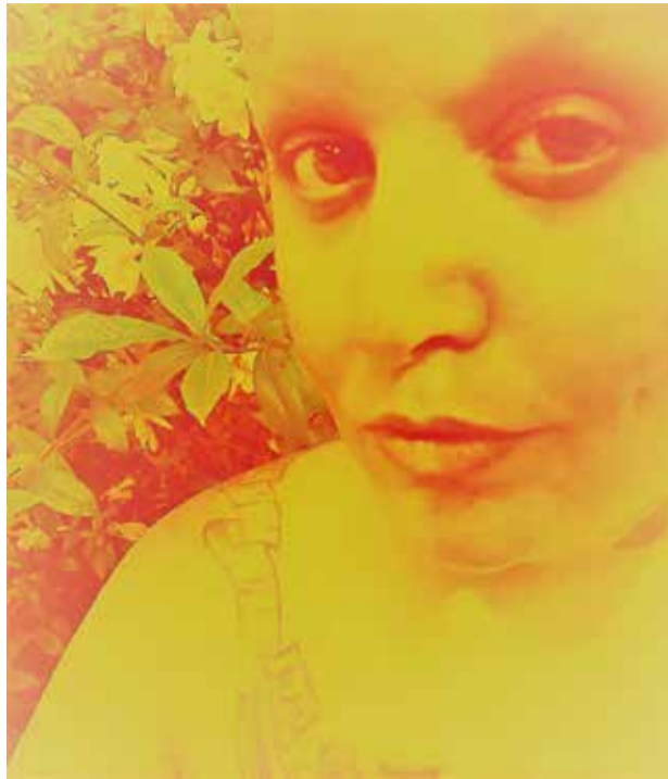
Secrets, 2020 12 x 10 in Digital Self Portrait