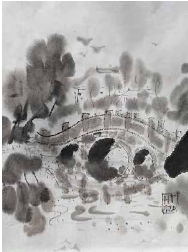
The Royal Bridge, 2020 20 x 15 in Mascara on Chinese Paper