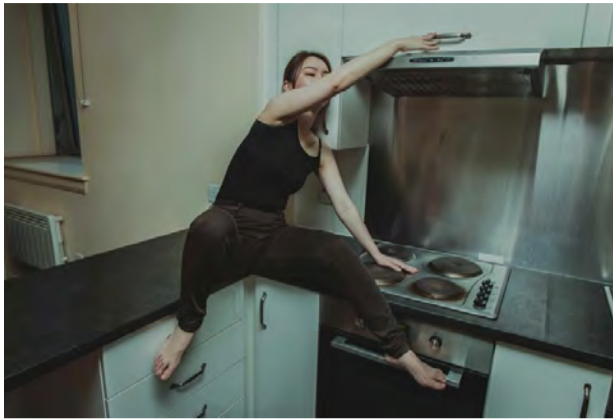
Merging 2, 2021 47 x 71 cm Digital Photography