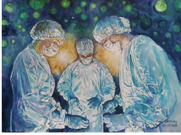
Pandemic Heroes, 2021