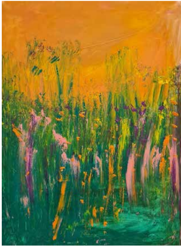
Untitled, 2021 70 x 50 cm Acrylic and Oil On Canvas