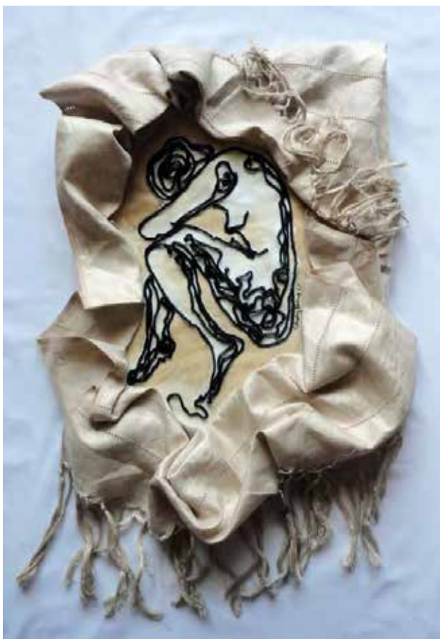
CobHIJA, 2021 60 x 40 cm Mixed Technique