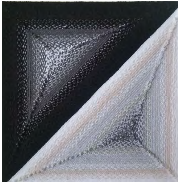
Yin and Yang, 2021 20 x 20 in Yarn on Canvas