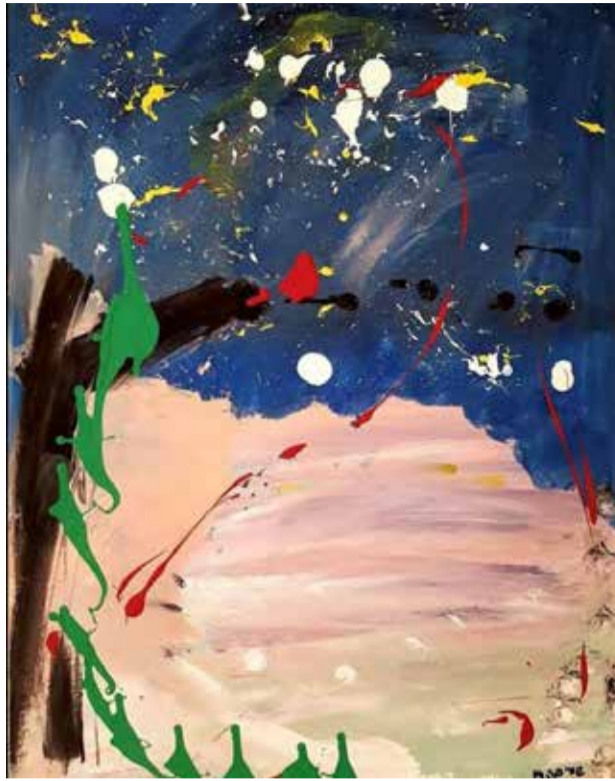
Untitled, 2021 70 x 50 cm Acrylic and Oil On Canvas