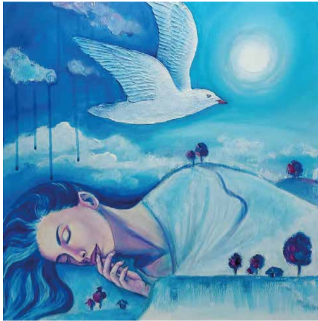
Starry Night, 2021 20 x 20 in Mixed Media on Canvas