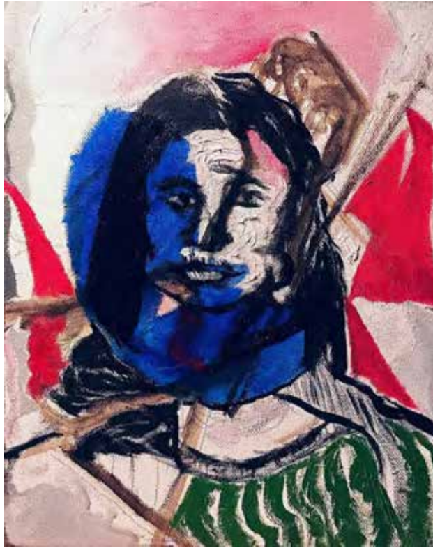
Woman Before a Mirror, 2021 12 x 9 in Oil on Canvas