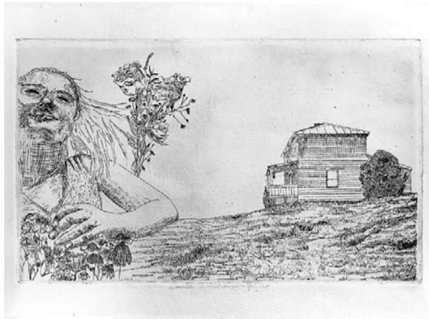
Optimistic in West Virginia, 2020 7 x 11 in Etching