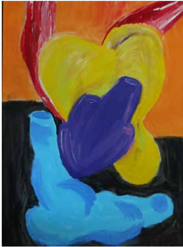
Abundance 12, 2021 100 x 70 cm Acrylic on Paper