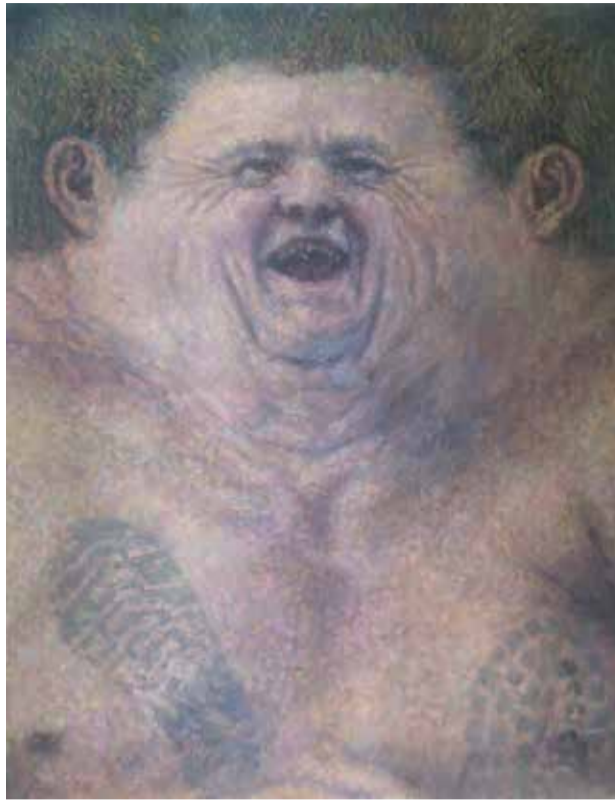
A laugh with only a shell 70 x 53 cm Oil Painting